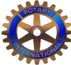
Rotary Club of De Pere